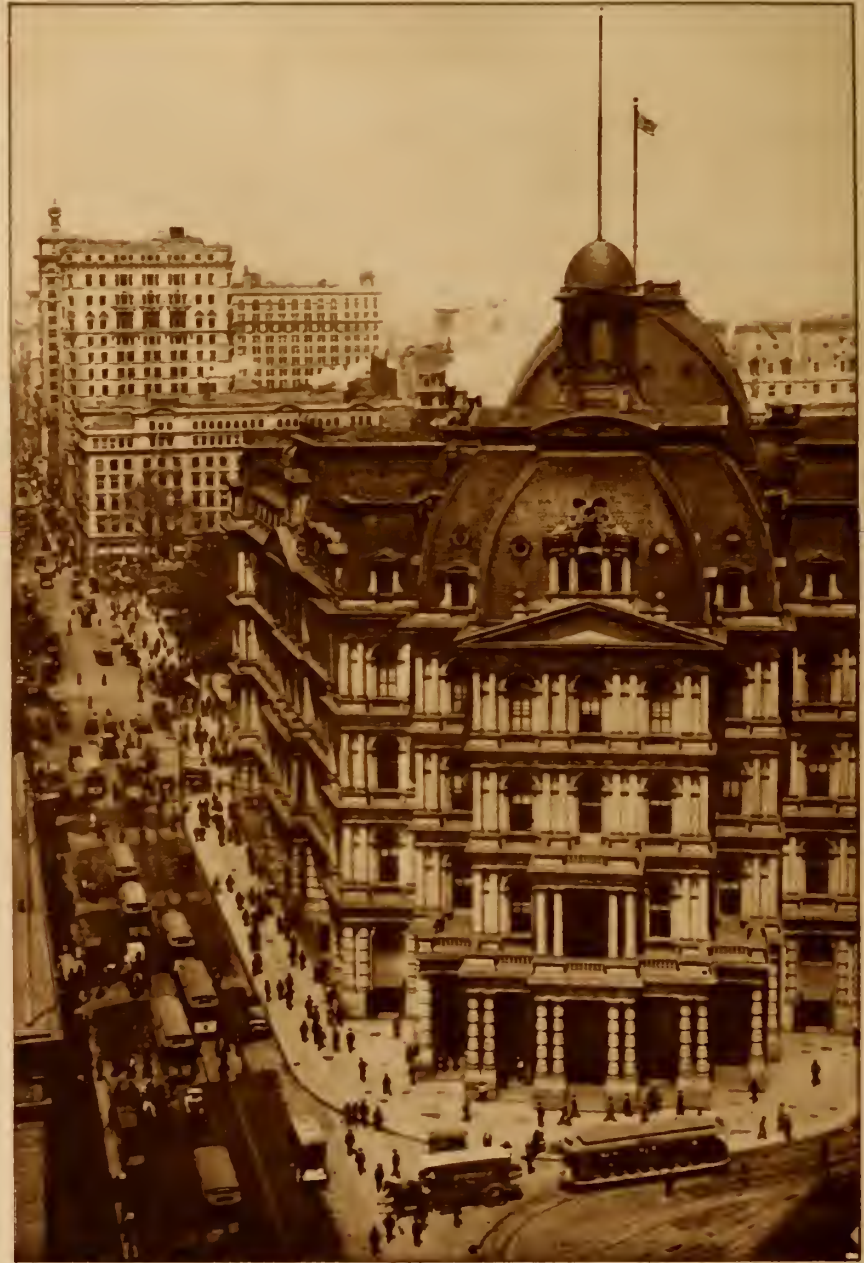
OLD U. S. POST OFFICE. Situated at Broadway and Park Row, now outgrown by the city and replaced by the new general post office on Eighth Ave.